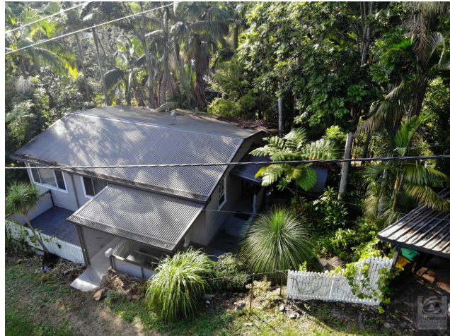
6 Mitchell Street